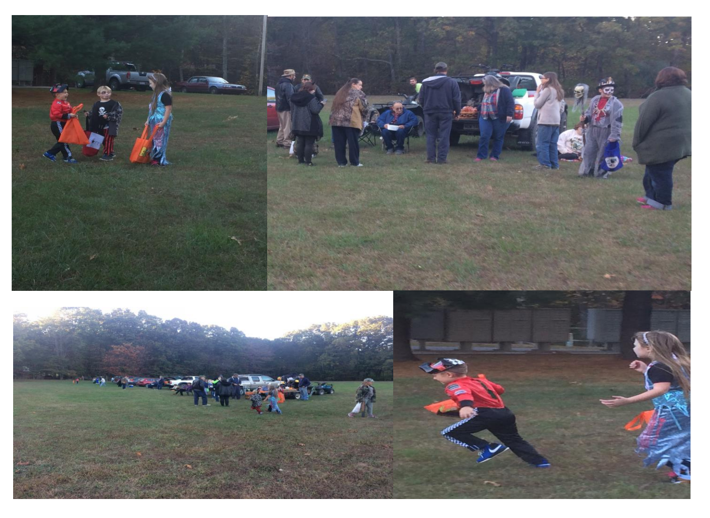
First Community Halloween Trunk or Treat, Oct. 27, 2017