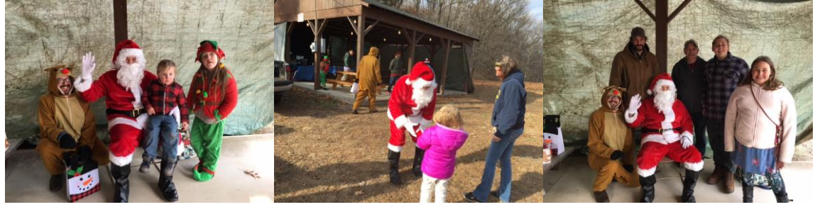
SHLOA Christmas with Santa: December 10, 2017

The first annual SHLOA Easter Egg hunt is scheduled for Saturday, March 24<sup>th</sup>, at 10:00 AM at the ball field. Residents and children are invited to attend, enjoy the festivities, and have their picture taken with the Easter Bunny! Please join us for this fun family event. Hop(e) to see you there!