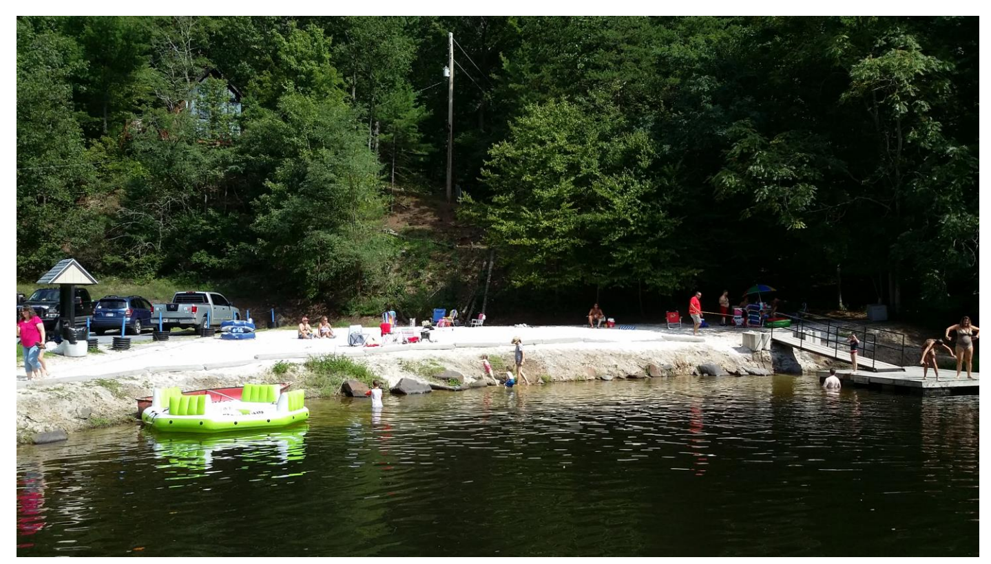
to this, so quickly???