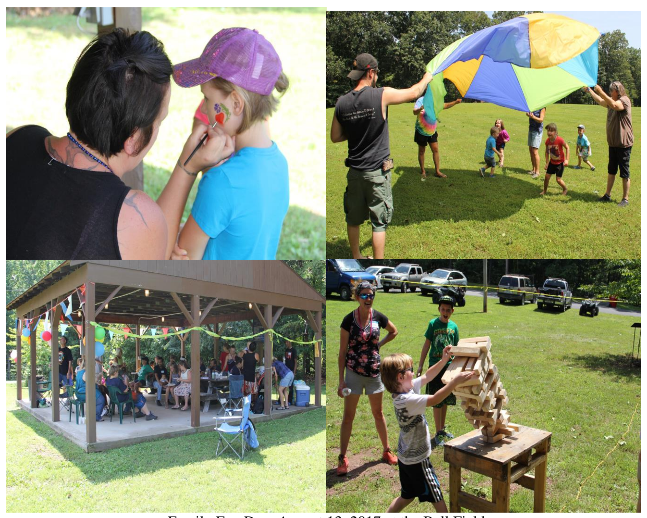
Family Fun Day, August 13, 2017 at the Ball Field